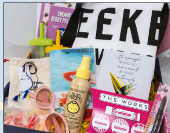
Teen Crate Summer 2022