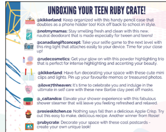
Fall 2022 Welcome Card