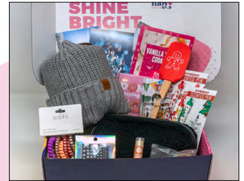
Tween Crate Winter 2022