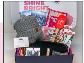
Tween Crate Winter 2022